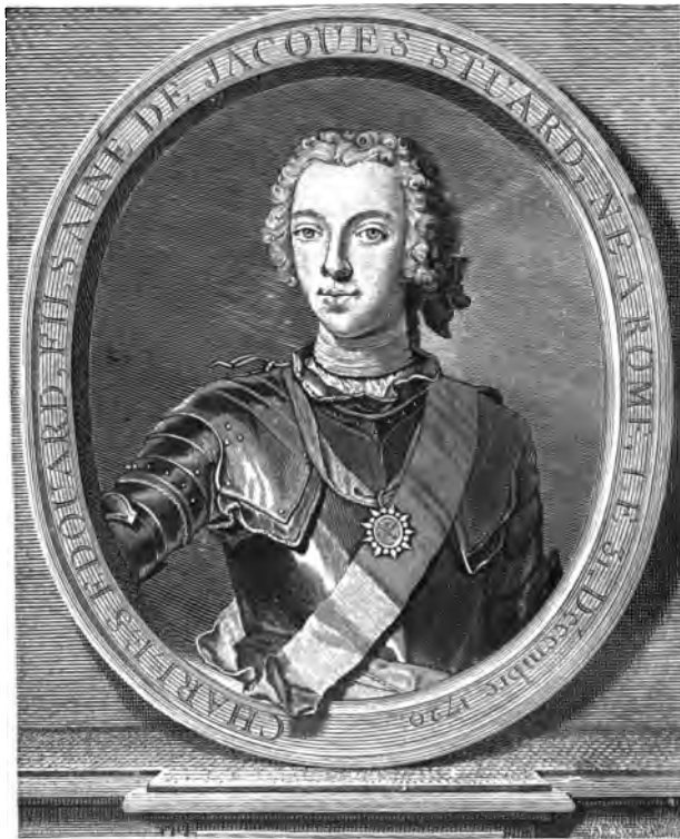
CHARLES EDWARD, THE PRETENDER